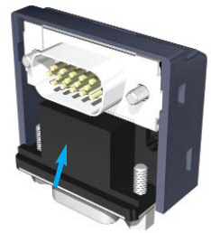
DL06 15-pin high density D-sub port adapter D0-06ADPTR

See the Wiring Solutions section in this catalog for more information.